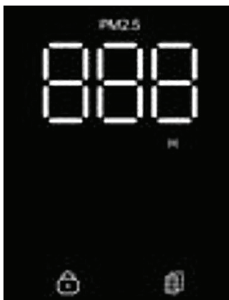
AIR QUALITY READING