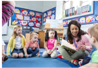
Day Care Facilities