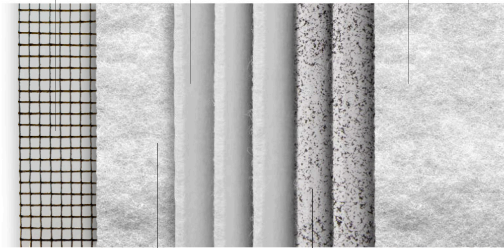
02 Prefilter Layer